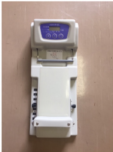
Figure 4. Toe Flexor Dynamometer

were conducted with participants seated with their hip joints at 90 degrees, knee joints at 90 degrees in a bending position, and ankle joint dorsiflexion at 0 degrees. Subjects were instructed to put both their hands on their knees during measurement, keep the upper body from leaning on the chair, put their five toes on the grip bar of the toe muscle strength meter, and flex their toes with maximum effort. The toe muscle strength of the left and right legs was measured twice each. The average of the greater of the values of the left and right legs was adopted as the representative value (Refer to Figure 4).