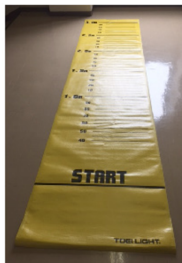
Figure 3. Mats for Standing Long Jump

Mats developed for standing long jump were prepared (TOEILIGHT CO., LTD., T-2598). The subjects prepared themselves by standing on the mat with their legs slightly apart and their toes aligned with the front edge of the take-off line and jumped when they were ready. At the time of the jump, they were instructed to jump forward as far as possible. The distance from the take-off line to the heel of the foot closest to the take-off line was measured and recorded twice; the greater value was used as a representative value.