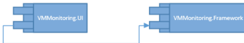
Fig. 2. Component diagram

VM-Monitoring.UI is consist of views that are shown to user it also includes graph showing data points of instance which is configured by cloud service consumer in this web application. For that user need to provide their Account keys (Access key and secrete key if account is associated with AWS, Subscription Id and certificate thumbprint if users account is associated with Microsoft Azure).