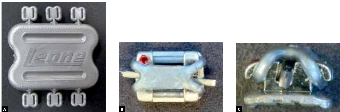
Figure 3 - A) Slide® elastic ligature, B) Frontal view of the ligature tied to a conventional metal bracket, C) Lateral view of this low-friction system, where there is no pressure on the orthodontic wire.

of the orthodontic treatment to increase efficiency in different clinical situations.