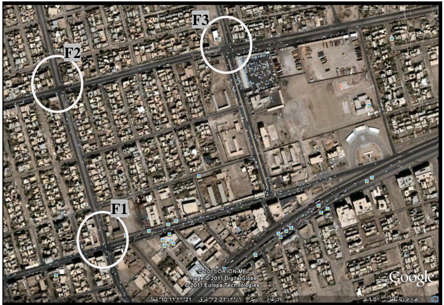
Figure 2 Satellite Image for Unsignalized Intersections in Fallujah City