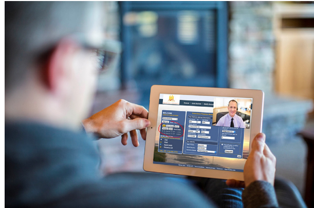
Figure 2. Consumer talking to a remote expert

the potential to elevate conversion to a whole new level due to the richness of immersion it provides the end user. Features such as co-browsing, screen sharing, and content sharing offer a level of interactivity that was not previously available. Recent research indicates that groups utilizing co-browsing technology have higher performance on metrics such as agent utilization rate and average revenue per call than groups that do not (Minkara, 2013).