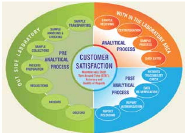
Fig. 2: Factors influencing Quality Control Process

In the post analytical stage the faults may occur if reporting, checking and verifications are not done properly, interpretation of test results are not considered seriously, and abnormal/unexpected result is not taken seriously and not reviewed and or performed again.