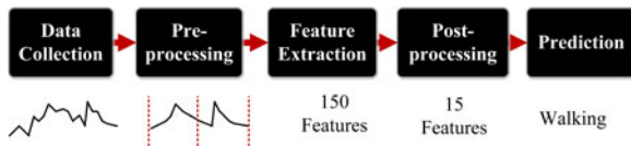
Fig. 2. Processing activity time-series data.

component is responsible for recognizing human activity patterns from various types of low-level sensor data. Different sensors produce different types of data. For example, data collected from most wearable sensors such as accelerometer or gyroscope are in the form of time series, ambient sensors such as motion sensors produce numerical or categorical data, and cameras and thermographic devices record image/video data. The activity itself can be represented and recognized at different resolutions, such as a single movement, action, activity, group activity, and crowd activity.