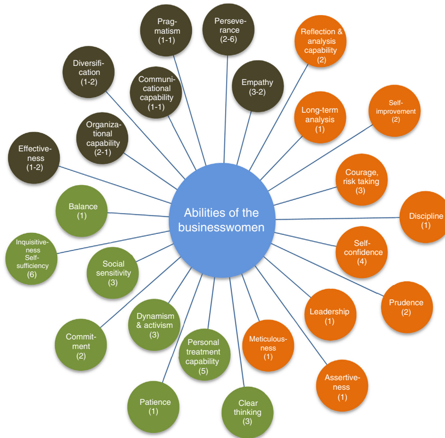
Fig. 1 – Relation of abilities that businesswomen have. Orange: outstanding abilities only by women; Green: outstanding abilities only by men; Brown: abilities highlighted both by women as by men.

women appear as a trained agent to perform its function. In addition, all the mentioned capabilities are facilitators of entrepreneurial activity, both those that are specific to a male norm entrepreneur as those that are more typical of female norm.