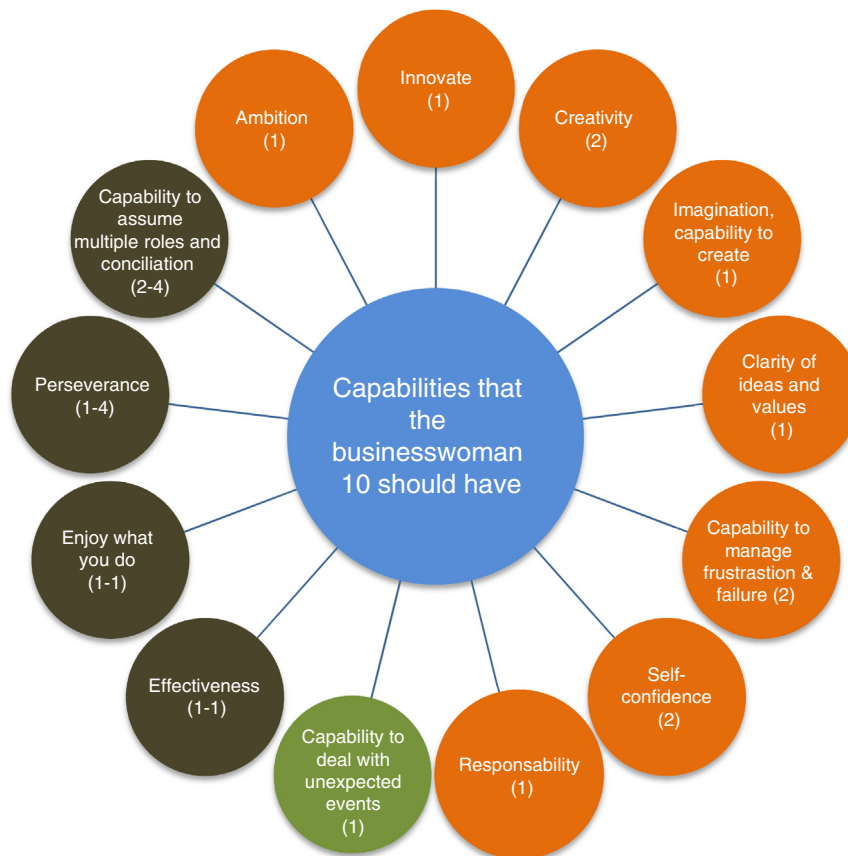
Fig. 3 – Relation of abilities that the businesswoman 10 should have, explicit by gender. Orange: outstanding abilities only by women; Green: outstanding abilities only by men; Brown: abilities highlighted both by women as by men.