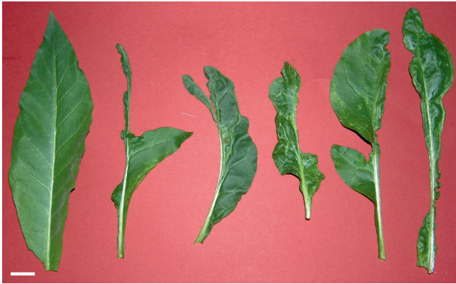
Figure 1. Typical Leaf Phenotypes of Transplastomic Plants Harboring a Knockout Allele for an Essential Component of the Translational Apparatus.

Leaves of transplastomic tobacco plants transformed with a knockout construct for the essential plastid gene rps18 (encoding plastid ribosomal protein S18; Rogalski et al., 2006; Table 2) are shown. The plastid transformants are heteroplasmic and, in the absence of antibiotic selection, the plants randomly segregate into homoplasmies for the wild-type plastid genome or homoplasmies for the transplastome. Homoplasmies for the rps18 knockout allele is lethal at the cellular level and results in loss of cell proliferation. Death of cell lineages during leaf development produces aberrantly shaped leaves that lack individual sectors or, in extreme cases, nearly the entire leaf blade (Ahler et al., 2003). Scale bar = 2 cm.