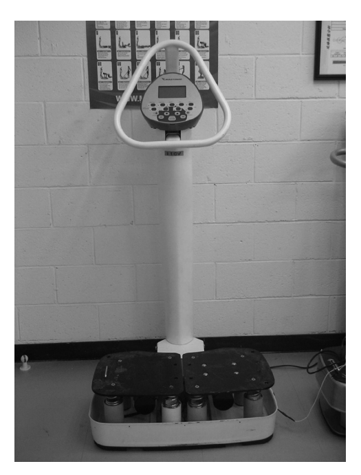
Fig. 1. Dual-plate whole-body vibration machine.