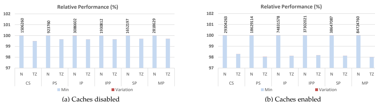
Fig. 2. Thread-Metric benchmarks results.