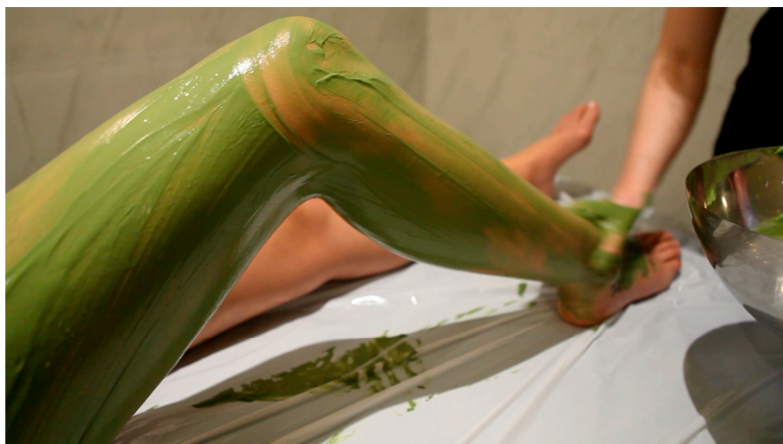
Figure 3. Marine mud (microalgal peloid) application (Talaso Atlántico, Oia, Pontevedra, Spain).